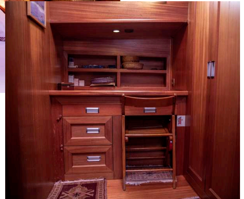
MASTER CABIN PORT